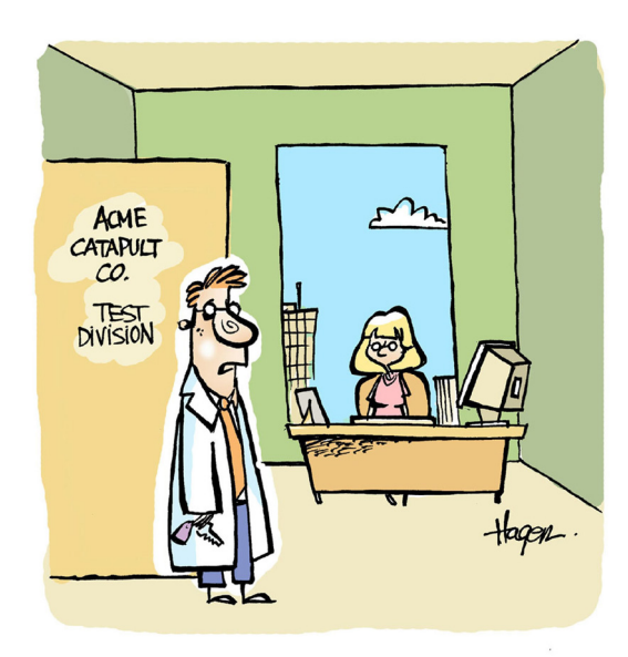
"If anyone calls, I've gone to look for Wally."

Business should also take out appropriate statutory liability cover to protect themselves should WorkSafe investigate or prosecute.